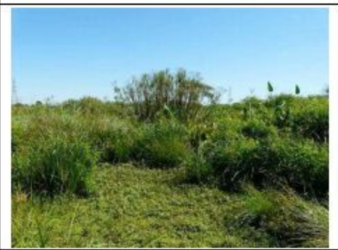
Foto 03: Exemplar florido de Ruellia coerulea registrado en el Foto 04: Grupo de tallos de Cyperus giganteus, popularmente conocido como piri.