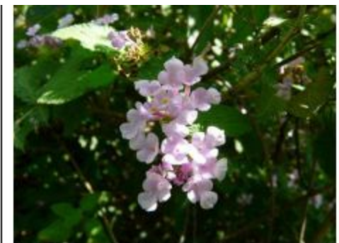
Foto 02: Flores en ejemplar de camara (Lantana megapotamica), encontrado en el punto de mustreo F - Fl 27.