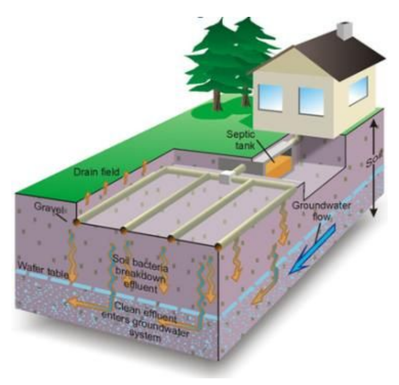
Figure 1. Design of a traditional leach field (Eawag, Gensch, & Sacher, 2014).

The leach field system has its advantages and its disadvantages. This system can be used in mostly all climates and has a relatively long lifespan. There are minimum maintenance requirements as well as low costs. However, the design and construction requires a certain expertise and a large area. A primary treatment system is required and there is a risk of clogging. There is also the possibility that the surrounding soil and groundwater can be negatively affected.