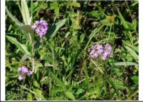
Foto 06: Ejemplares floridos de Glandularia dissecta, especie popularmente conocida como margarita poty, encontrados en el punto de mustreo F – Fl 25.