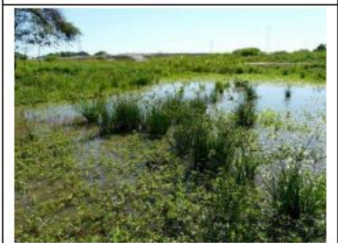
Foto 05: Plantas higrófitas, destacando los ejemplares de Cyperus virens (en el centro de la foto).